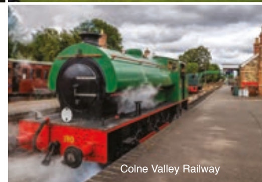
Colne Valley Railway

For visitors, Braintree Village continues to be a huge draw to our district, with the centre recognised regionally for its high-end fashion stores and bargain prices.