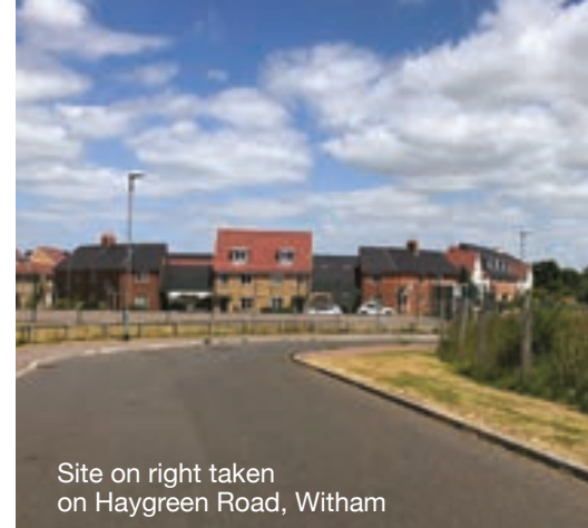
Site on right taken on Haygreen Road, Witham