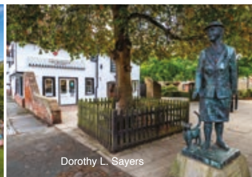
Dorothy L. Sayers

There is so much that is special about the Braintree District. We want to shout about some of the highlights it has to offer.