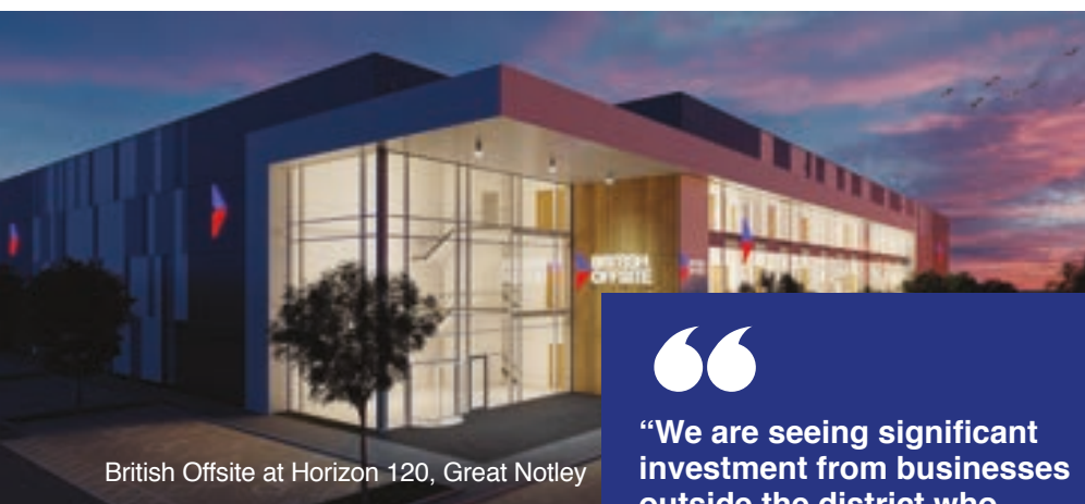
British Offsite at Horizon 120, Great Notley

Horizon 120, a 65-acre employment site just off the A131 in Great Notley, is well on its way to becoming an exemplar business park offering modern, flexible business accommodation, energy efficient buildings, amenities and facilities and best in class fibre optic connectivity.