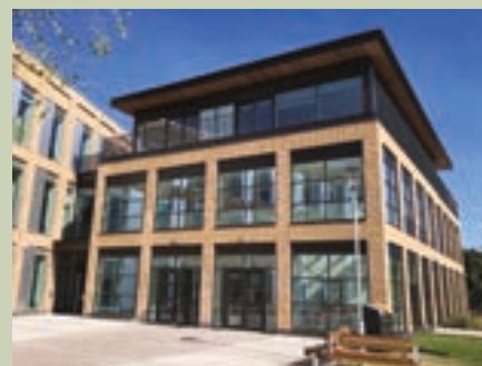
The Plaza at Horizon 120, Great Notley