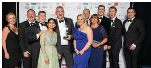
Barker Associates based in Braintree