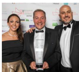
Coco Lighting Ltd based in Braintree