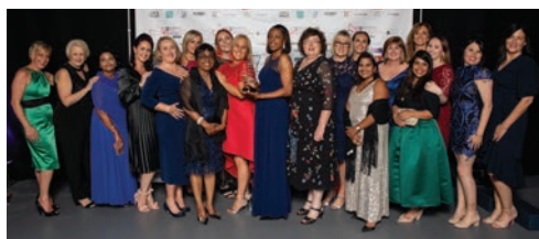
Community Dental Services CIC in Essex