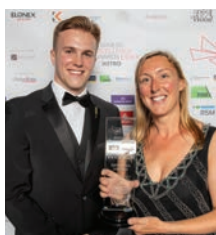
Tuffon Hall Vineyard based in Castle Hedingham