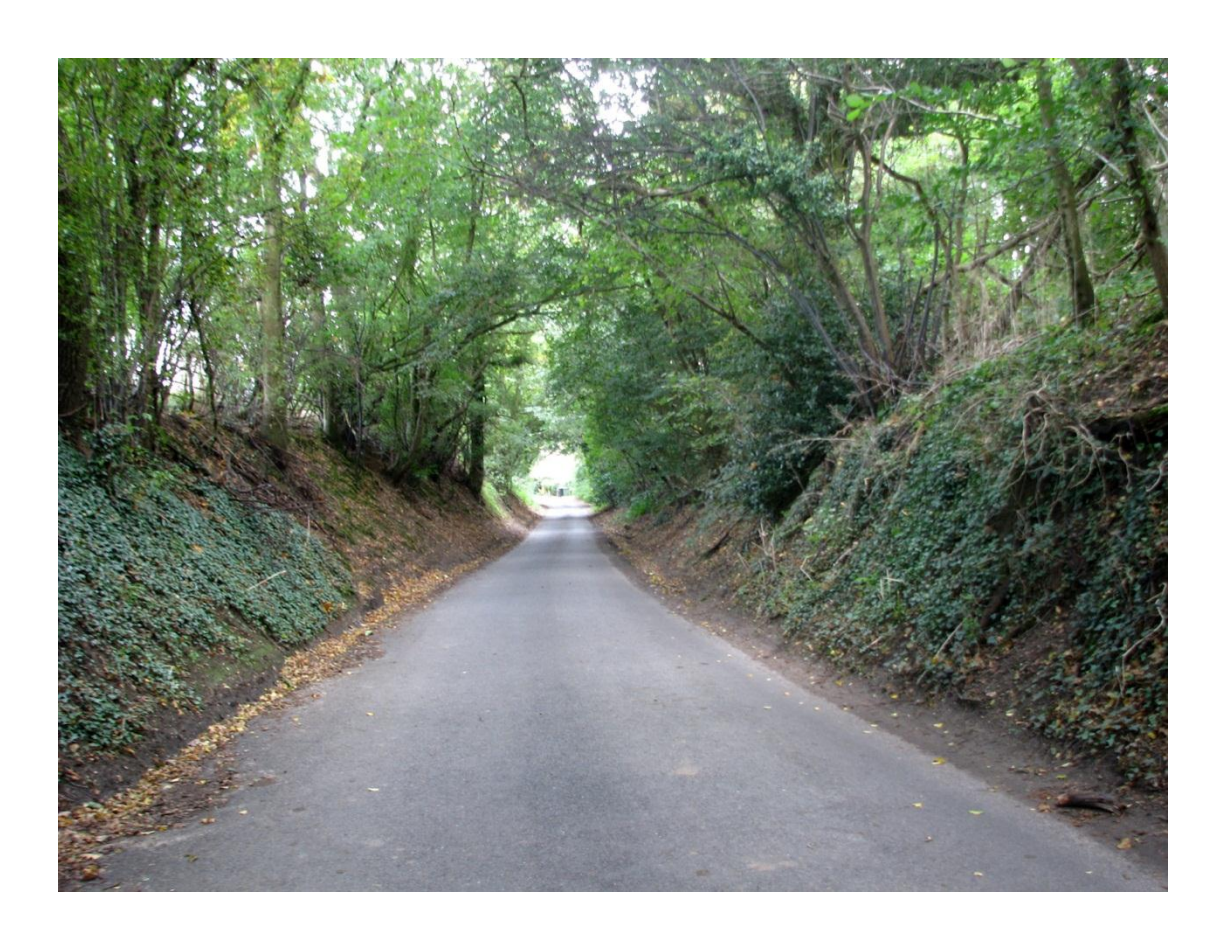
Figure 4 - Sunken lane at Hulls Lane (BTELane 35)