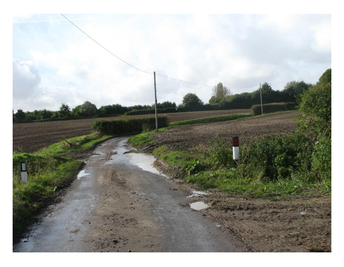
Figure 6 - Shows area of disturbance from field entrance and agriculture up to the edge of the lane (BTELane 64)

Description of erosion damage – this was a description of erosion damage to the structure of the lane from vehicular traffic along the length of the unit of assessment. The description included information on damage to banks, verges and surfaces.