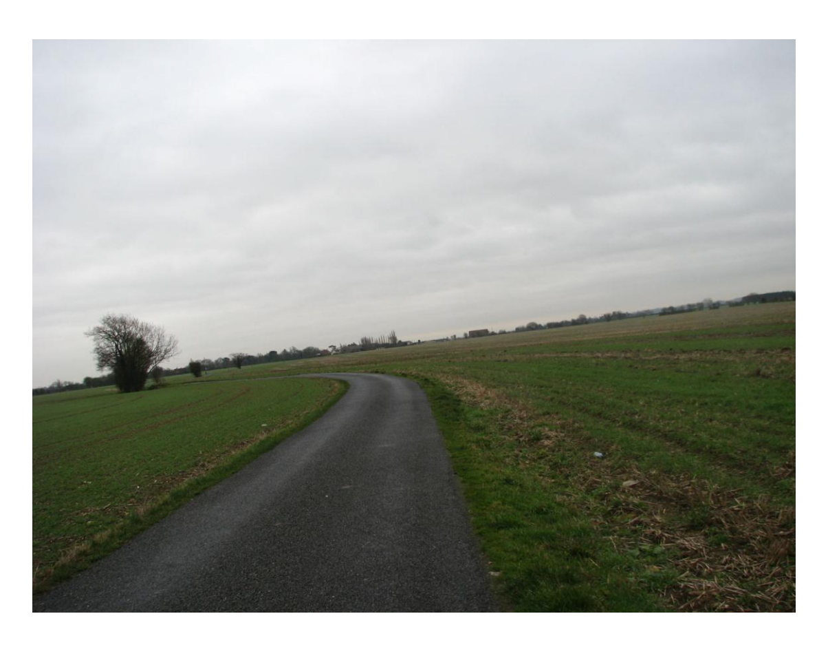
Figure 12 – Agricultural production to edge of road with the removal of the verge, ditch and hedgerow (BTELANE140)