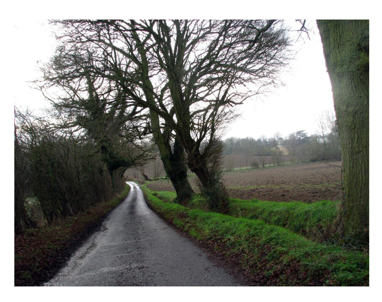
Figure 2 - Change in form of lane with drop into the valley (BTELane 125)

• Form(s) that the lane took e.g. sunken, flat, raised, or lynchet (positive lynchet on uphill side and/or negative lynchet on down hill side).