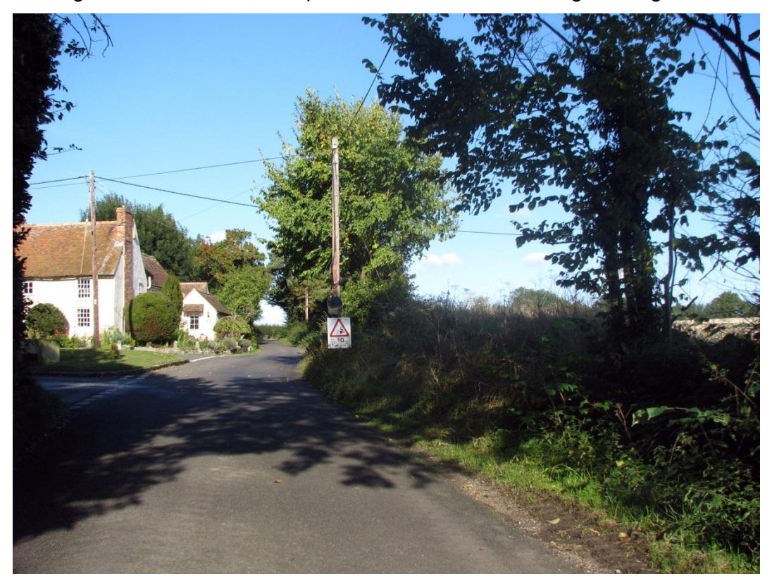
Figure 7 - Fairstead Road showing improvements of kerb stones and road signs (BTELane 13)

Description of improvements – this was a description of any significant improvements that had been made to a lane along the length of the unit of assessment. The description included information on the type and extent of traffic calming measures and other 'improvements' such as widening, kerbing etc.