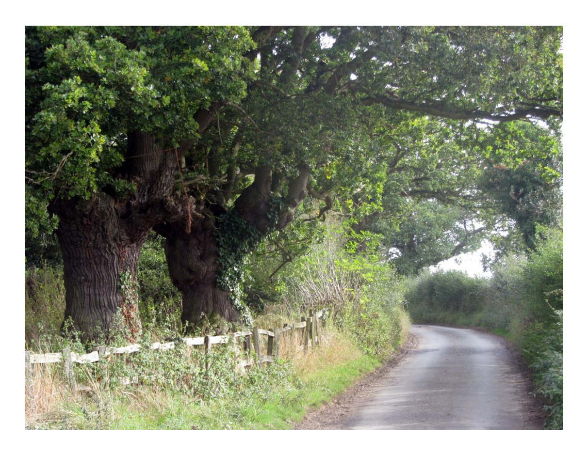
Figure 5 - Veteran pollards (BTElane 4)

Associated vegetation e.g. hedgerows (with an indication of species mix i.e. largely single species, large variety of woody species etc, veteran trees (including pollards, coppice stools), mature trees, grass / flowering plants on verges and banks.