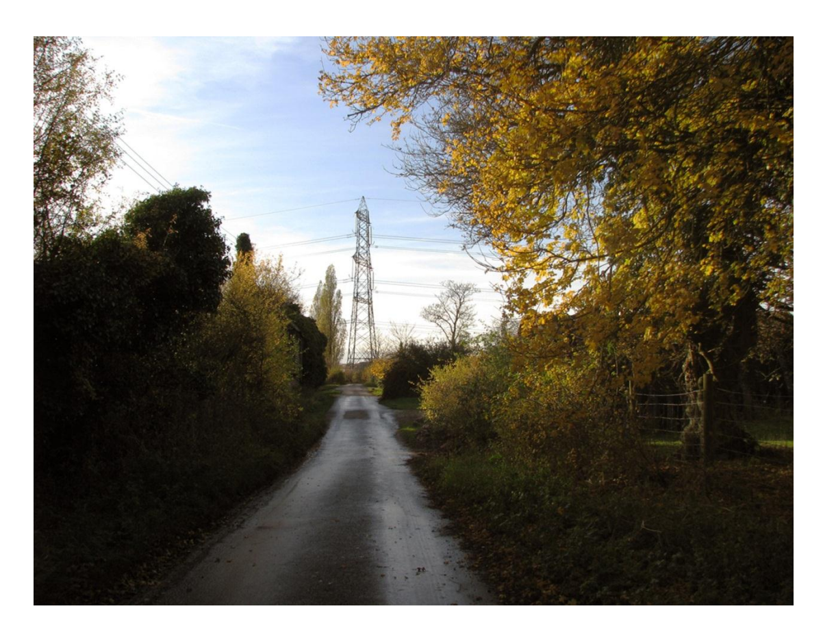
Figure 10 - Modern intrusion on aesthetic view of Lorkin Lane (BTELane 85)