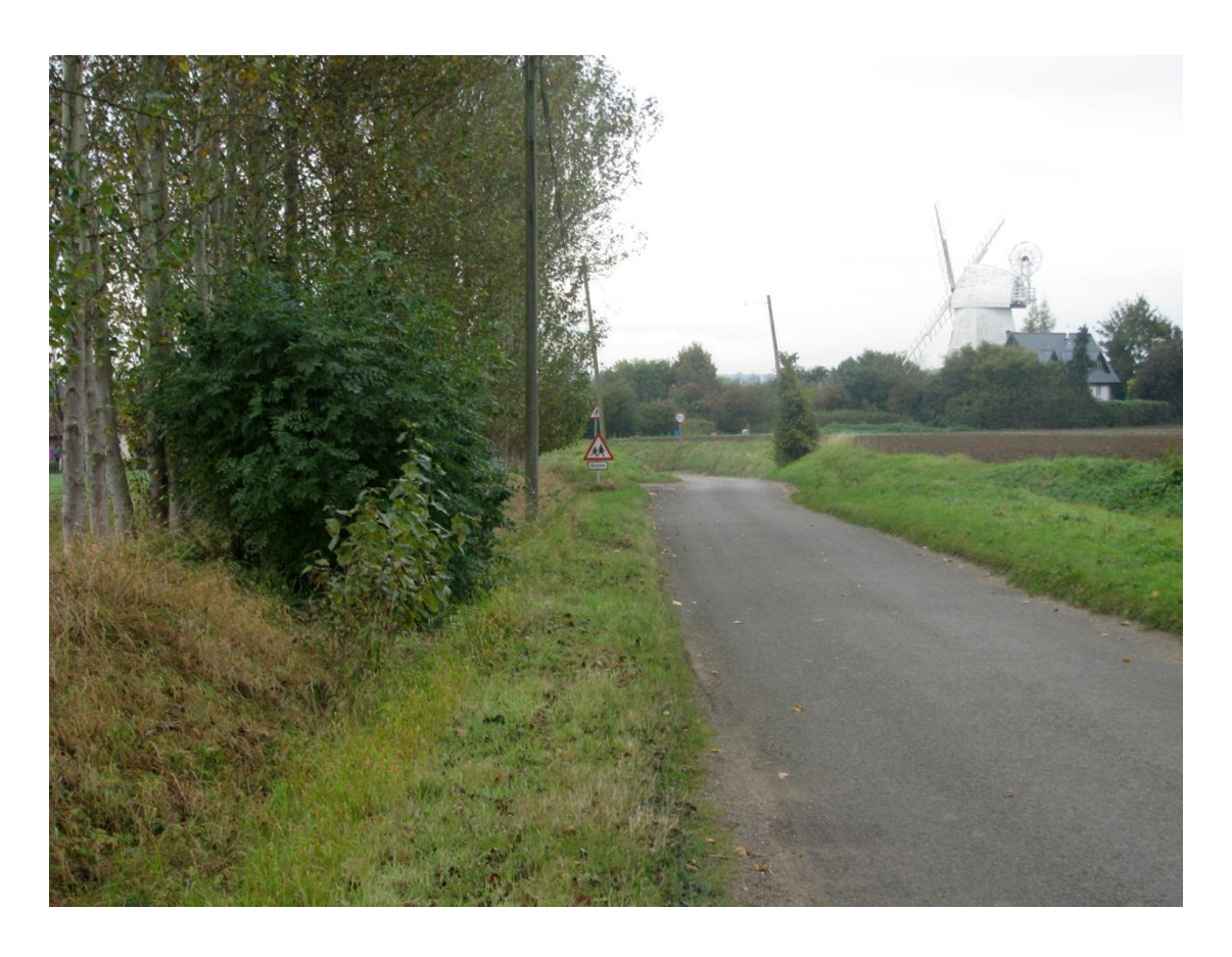
Figure 9 - Waltham Cross Road with view of Great Bardfield Windmill (BTELane 43)

Views – notable views, which are particularly scenic, unusual or which include contemporary historic features of note e.g. a parish church, listed building, farm complex or landscape that are framed by the lane and/or its associated vegetation were identified.