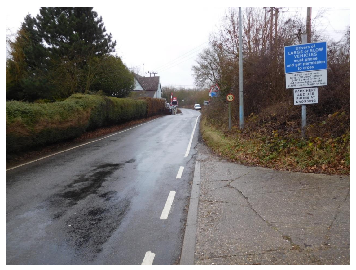
Figure 7 – Station Road showing improvements of kerb stones and road signs (CRESSLANE5)