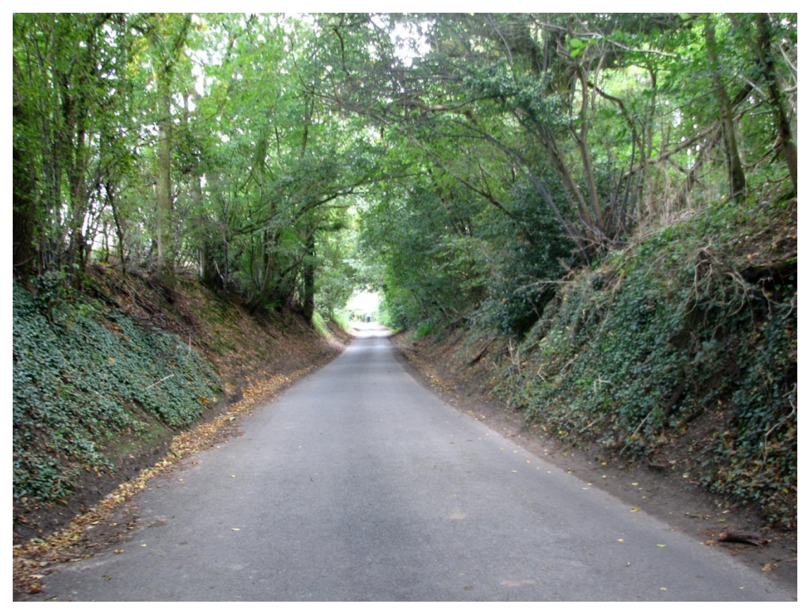
Figure 4 - Sunken lane at Hulls Lane (BTELane 35)

Associated vegetation e.g. hedgerows (with an indication of species mix i.e. largely single species, large variety of woody species etc., veteran trees (including pollards, coppice stools), mature trees, grass / flowering plants on verges and banks.