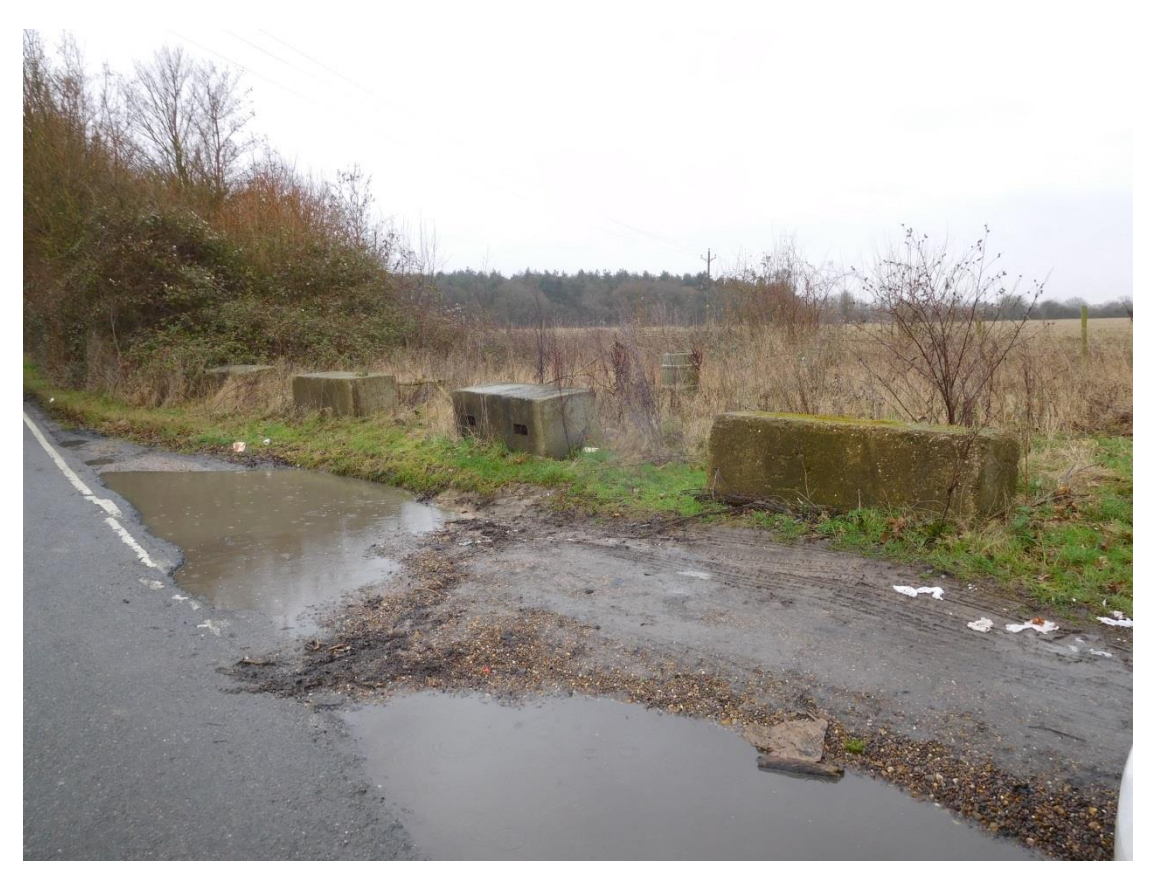
Figure 6 - Shows area of erosion in an area used for parking, with concrete blocks at field entrance (CRESSLANE5)

Description of erosion damage – this was a description of erosion damage to the structure of the lane from vehicular traffic along the length of the unit of assessment. The description included information on damage to banks, verges and surfaces.