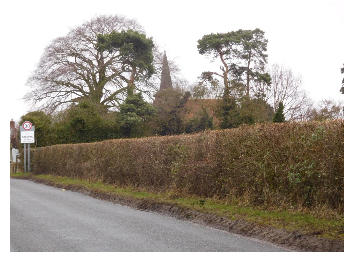
Figure 9 – Church Road with view of Cressing Church (CRESSLANE8)

Views – notable views, which are particularly scenic, unusual or which include contemporary historic features of note e.g. a parish church, listed building, farm complex or landscape that are framed by the lane and/or its associated vegetation were identified.