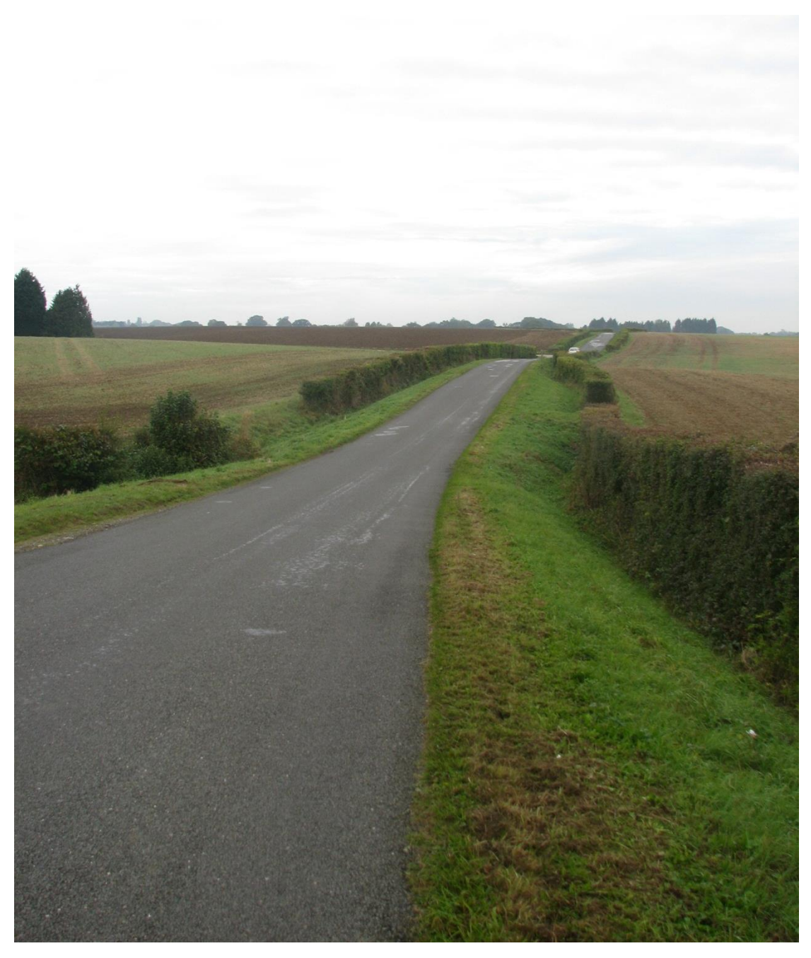
Figure 3 - Verges on undulating lane at Shalford Road (BTELane24)