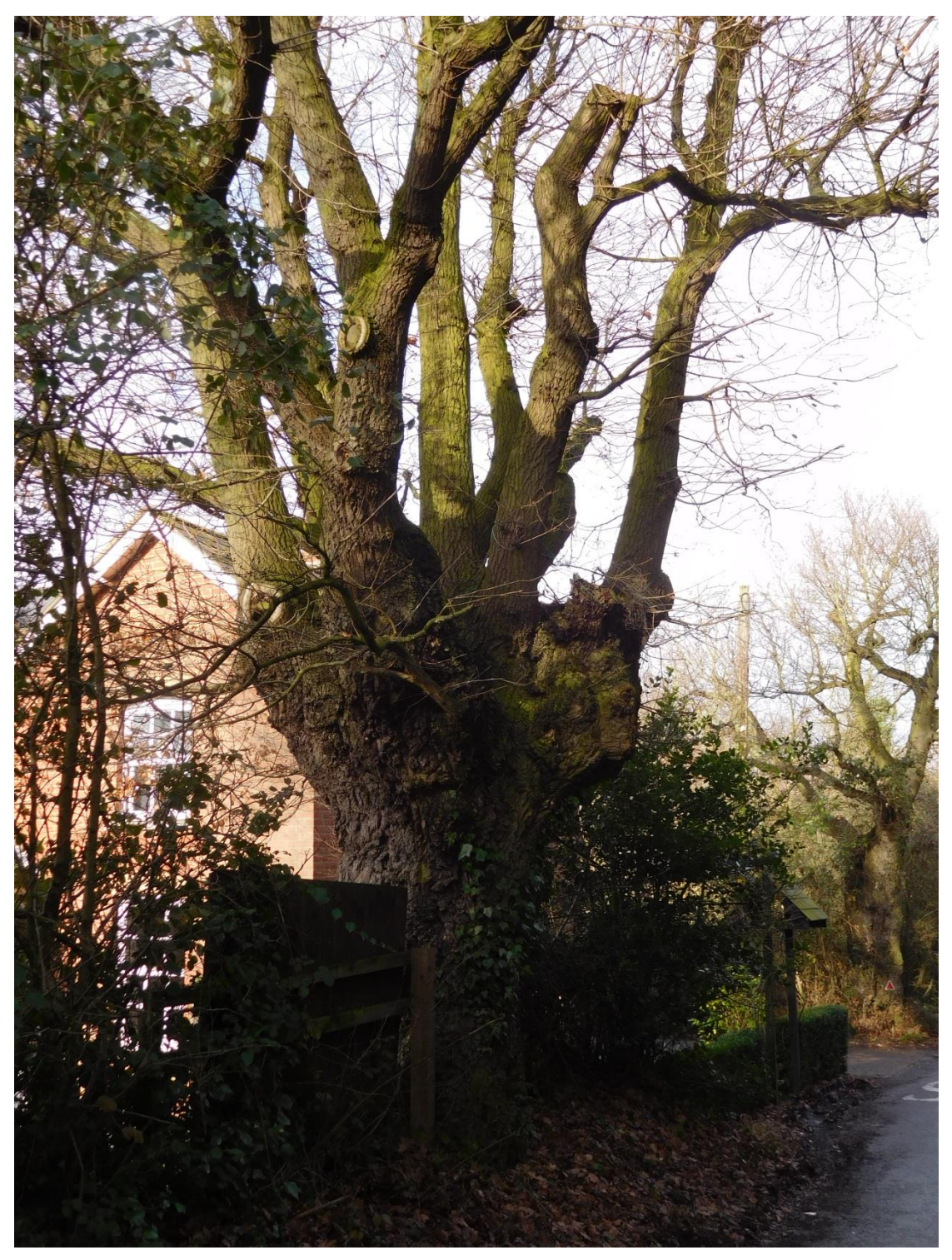
Figure 5 - Veteran pollard (CRESSLANE2)