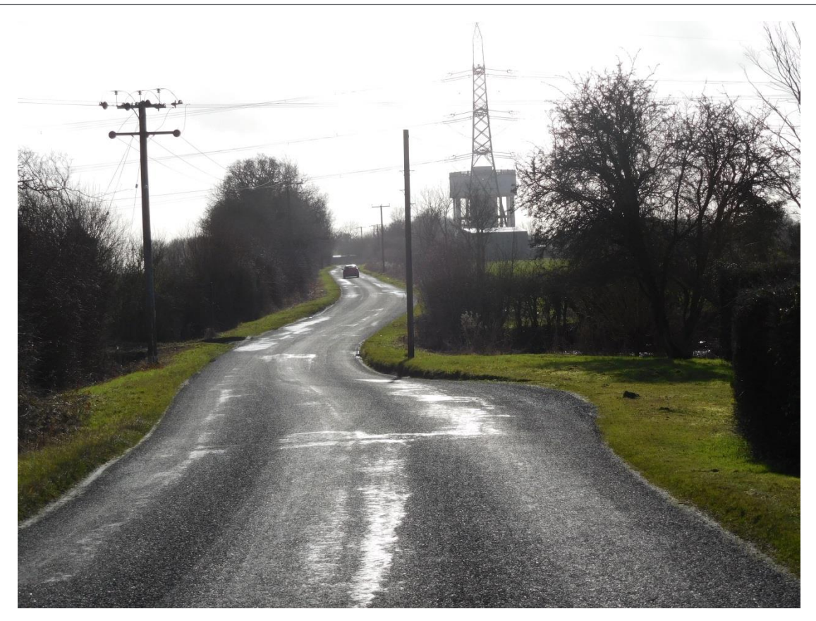
Figure 10 - Modern intrusion on aesthetic view of Lanham Green Road (CRESSLANE7)