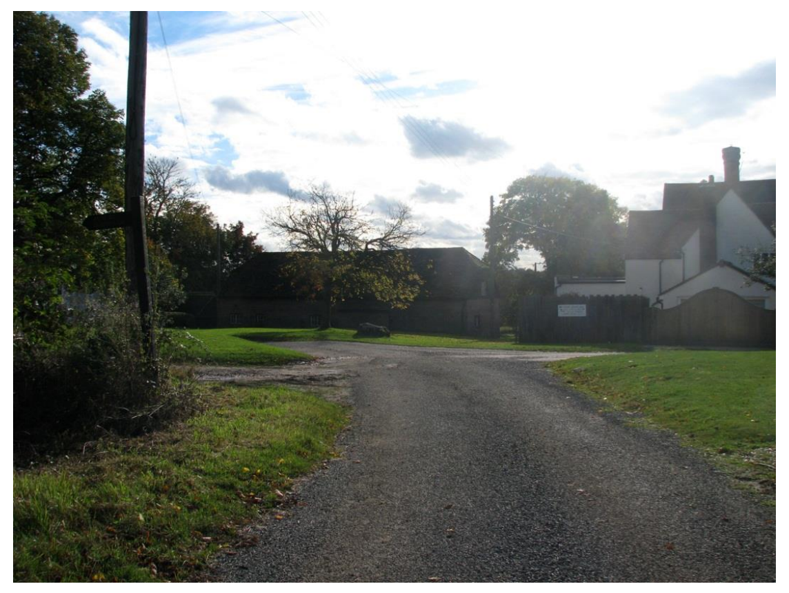
Figure 8 - Greens at Codhams Lane forming part of the important historic settlement associated to this short length of lane (BTELane 28)