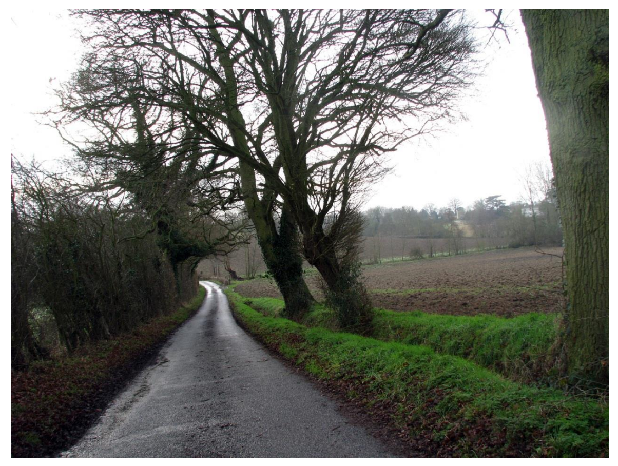
Figure 2 - Change in form of lane with drop into the valley (BTELane 125)