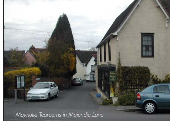
Magnolia Tearooms in Majendie Lane