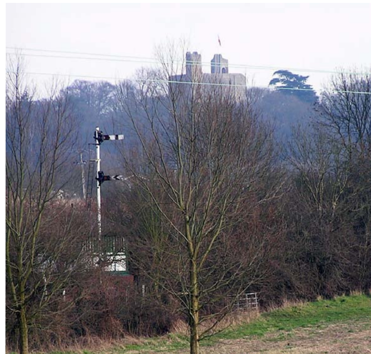
From the Colne Valley Railway to the Castle

The decline in the rural lifestyle throughout the country has been driven by the closing of local businesses and community facilities. Although Castle Hedingham has lost many of its shops over the years it is still able to cater for most of its villagers' needs. This is appreciated by residents of all ages who remain determined to do everything possible to maximise employment opportunities and preserve the existing community and leisure facilities.