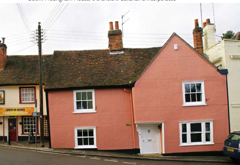
Below: Queen Street, Chapel Green. At the far left of the picture a part of Bangslappes where hops were threshed can be seen