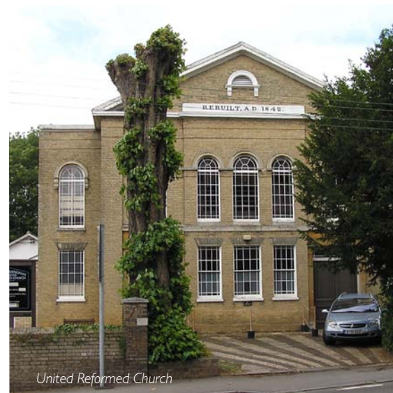
United Reformed Church