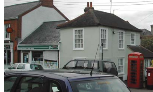
Above: Post Office and Shop, central to the village scene

The benches and litter bins in the village have been provided piecemeal but are visually neutral. There are three 'listed' milestones within the Parish and the Telephone Kiosk in St James Street is also 'listed'.