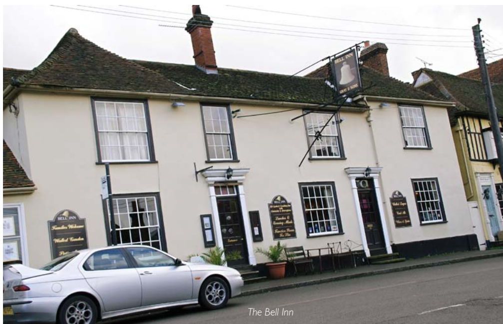
The Bell Inn

with sash cord windows and panel front doors predominating. The choice of generally soft pastel external colour finishes has enhanced the overall appearance of the centre both as infill panels on the exposed timber dwellings or the more common rendered dwellings.