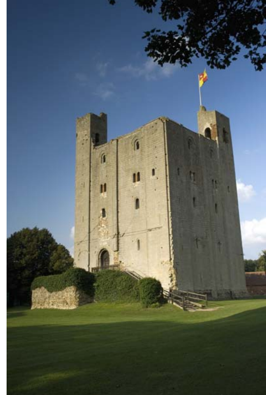
Above: The keep at Hedingham Castle

Large swathes of modern Castle Hedingham are of Norman origin, although land use has changed considerably over the years and what were once Castle grounds are now covered with houses and businesses. During their 600 years of Lordship in Hedingham, the de Veres erected many fine buildings, some of which still stand today. In addition to the lofty Castle, they also built the ancient church of St. James, renamed St. Nicholas at the Reformation, which Nicholas Pevsner called the most exciting church in Essex. There are lodges, farmhouses, inns and cottages associated with the de Veres.