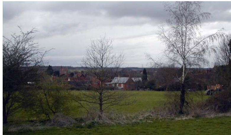
Above: The Playing Fields enjoy a fine view over the village. Below: Chapel Green at the junction of Queens Street and Sheepcot Road