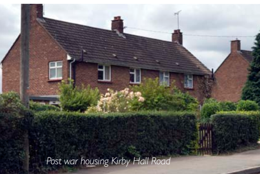
Post war housing Kirby Hall Road