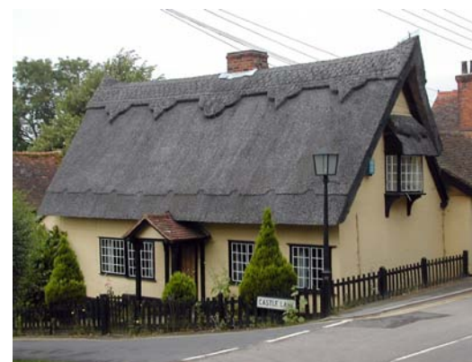
A few thatched roofs remain