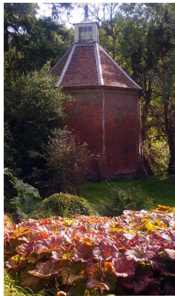
Below: The listed Dovecot in the grounds of Hedingham Castle

The Dovecot in the bog garden is dated 1720 on its brickwork and is one of the four listed buildings in the grounds. The others are the Castle Keep, the Tudor Bridge and Hedingham Castle House. Hedingham Castle House, circa 1718-19, was built for Sir Robert Ashhurst. It is of red brick with stone dressings and red plain tiled roofs.