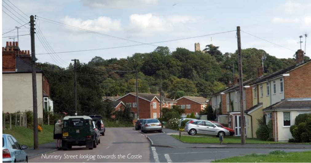
Nunnery Street looking towards the Castle

part public house, thought to be 16th Century or earlier with attractive gables at each end of the front.