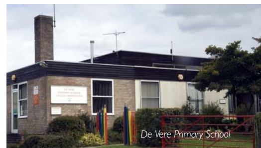
De Vere Primary School

up the local scouts. Wooding Lodge on Sheepcot Road was purpose built for the Castle Scouts in 1987 and provides a meeting place for Beaver Scouts, Cub Scouts, Scouts, Explorer Scouts and Girl Guides. Rainbows and Brownies meet at De Vere School.