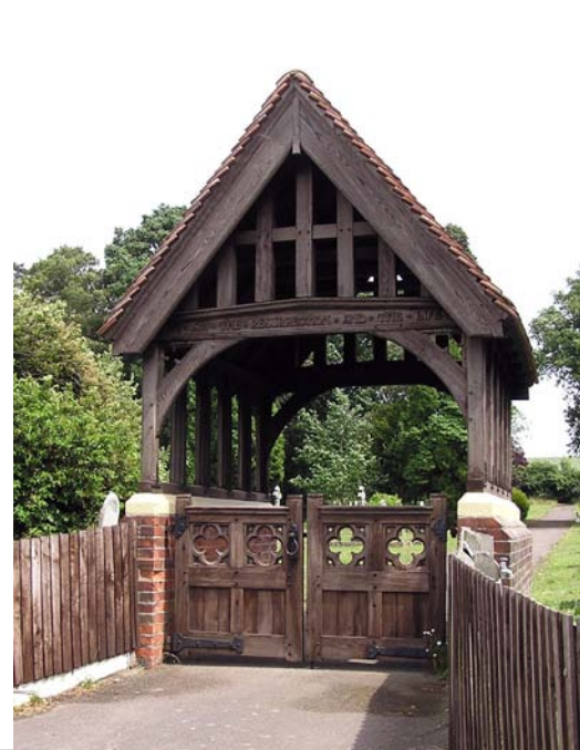
Below: Lychgate built by local craftsmen nearly 100 years ago