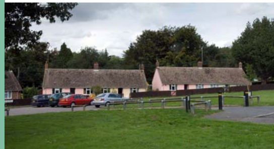
Above: Deer Park, a hunting ground in former times