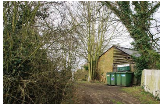
Above: Recycling bins - discreetly located