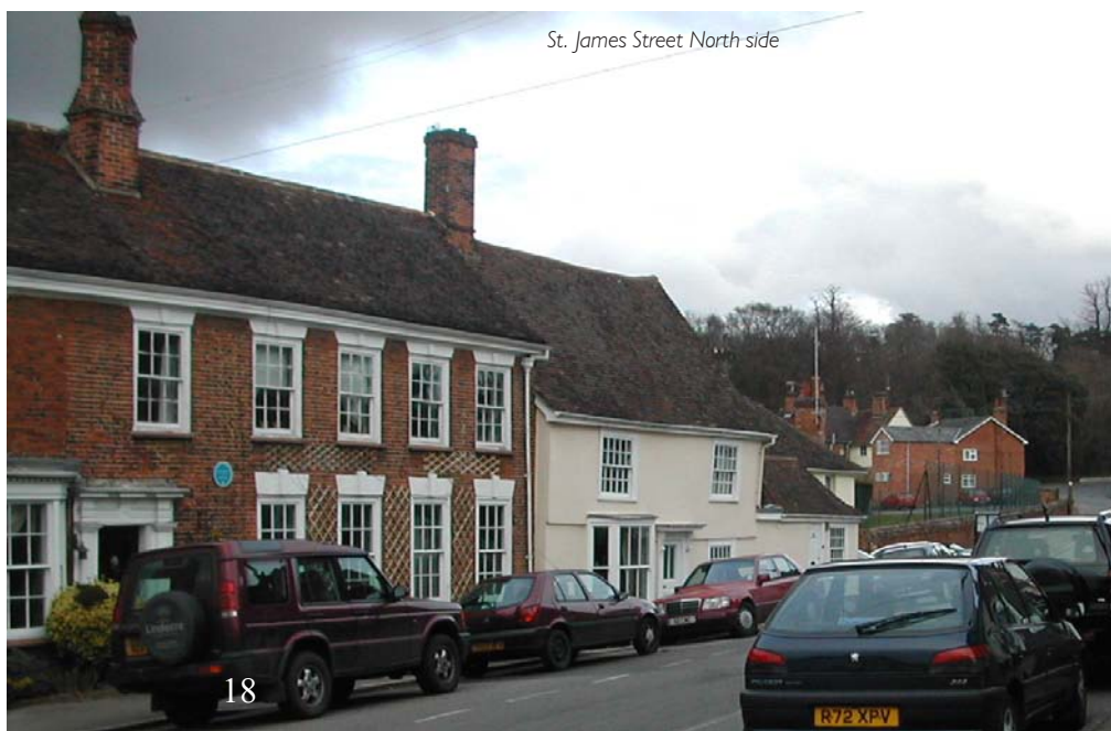
St. James Street North side