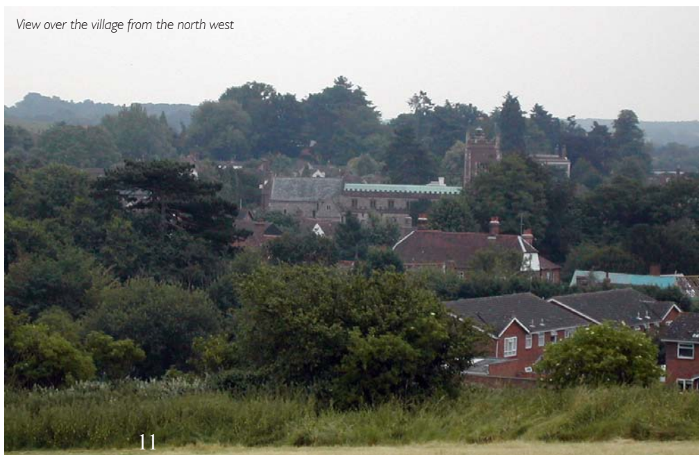
View over the village from the north west