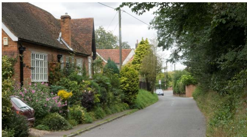
Above: Sheepcot Road Below: The Great Wellingtonia and The Old Vicarage