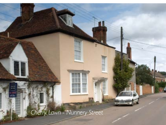
Cherry Lawn - Nunnery Street