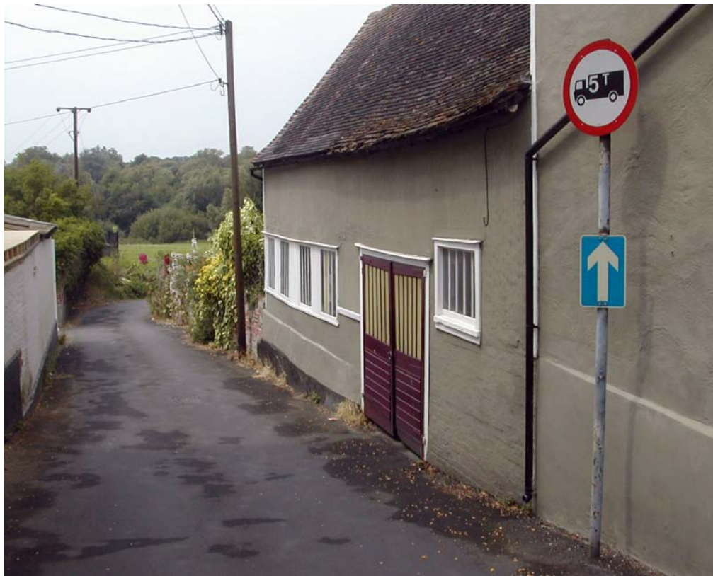
Above: Ripper's original workshop in Castle Lane. Below left: Traditional local bricks in the tennis court wall. Below right: The Old Moot House, Restaurant

In the 20th Century the rural nature of Castle Hedingham continued to change: the scale and nature of farming and the employment it provided has led to a reduction in the workforce required and this and other factors have meant that there has been considerable emigration from the area. As a result in the 21st Century many inhabitants travel considerable distances to their work.