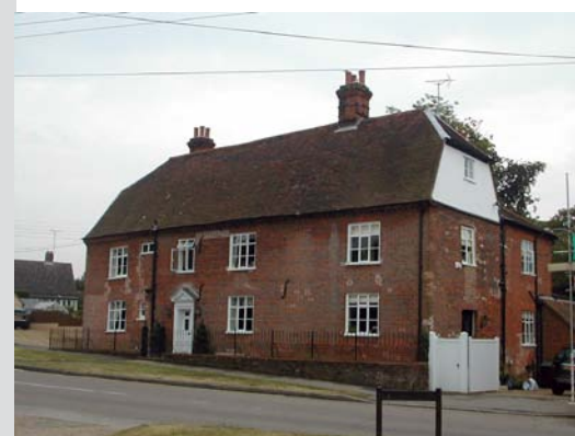
Traditional lime mortar repairs