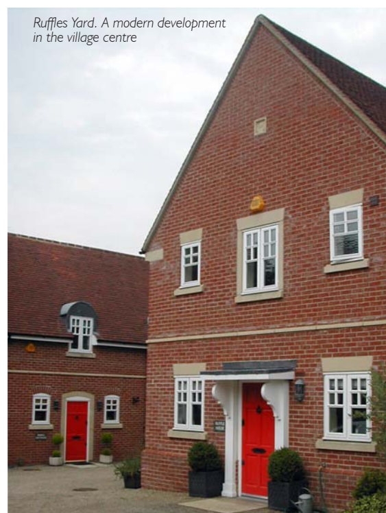
Ruffles Yard. A modern development in the village centre