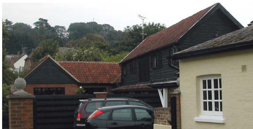
Discreet barn conversion back development