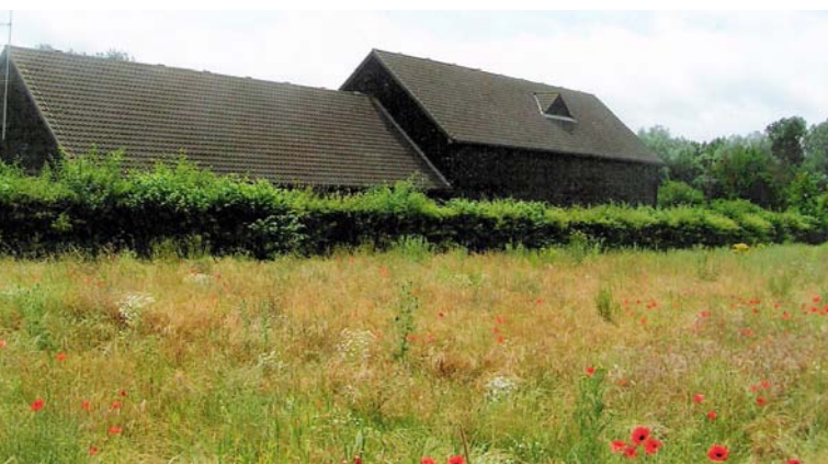
Industrial Building blends with the landscape