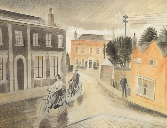
Falcon Square in the 1930's by Eric Ravilious, © Estate of Eric Ravilious/DACS 2008.