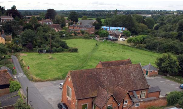
Above: The Allotments, a major open space in the village centre. Below: There are extensive green areas in Bowmans Park

The Allotments, no longer in use, were on the piece of land adjacent to the Memorial Hall, which is also part of the Castle Estate. The open spaces within the village allow some outstanding views of the village and its historic buildings. Areas of open space at Deer Park Close and on the south side of New Park are designated as 'Visually Important Spaces' in the Braintree District Local Plan Review. They are protected from inappropriate development through Policy RLP4.