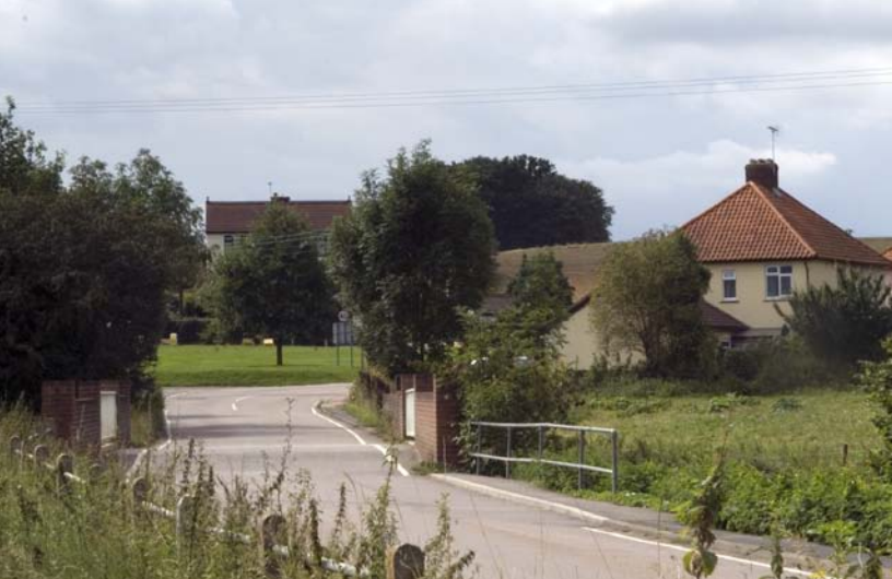
Above: Crouch Green and the bridge in Nunnery Street, signs of the earliest settlement and the ford across the river