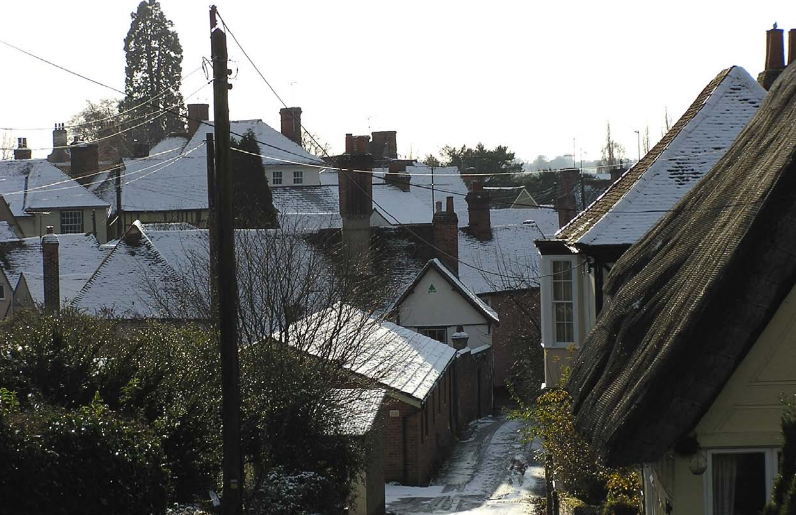
Roofscape of the village centre from the top of Castle Lane