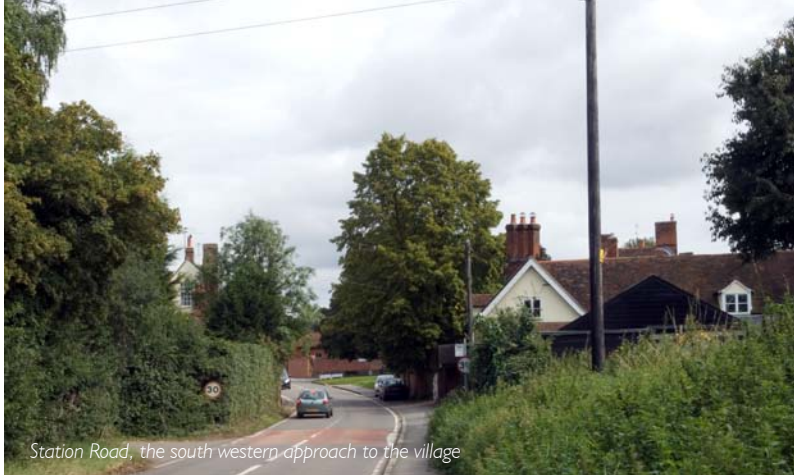
Station Road, the south western approach to the village