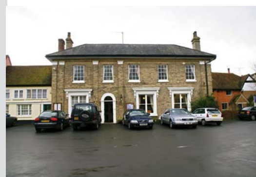
Replacement Georgian brick facade of Hayes House