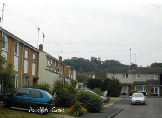
Park Vale Close