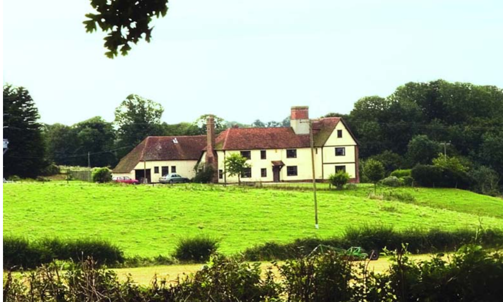
Above: Little Lodge Farm from Sudbury Road

Hedingham Castle Keep is the most visible element of the village. It can be seen when approaching the village from all directions and for many villagers the sight provides a