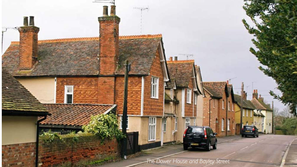
The Dower House and Bayley Street

Nowadays within the centre only three thatched cottages remain, located in Castle Lane. However it is clear from the steep pitch of other roofs in the centre that thatching was once more popular than today. Predominantly clay peg tiles have been adopted throughout the centre based on the local availability of this material. Some later brick built Victorian properties are slate-roofed but generally modern infill