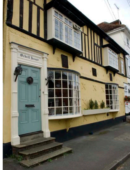
Orbell House exhibits pargetted rendering, exposed timber and varied window styles

It is clear from the questionnaire and comments recorded during the exhibition that very few residents are against change. However, there is a strong feeling about the process for managing change and the way in which the decision makers will nurture and protect the rich variety of architecture that is Castle Hedingham.