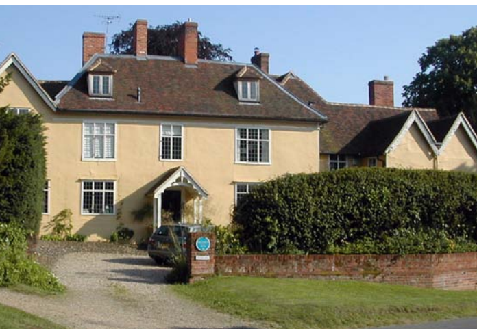
Above: Sheepcot House Below: Trinity Hall

This small country lane heads northwards from the Sudbury Road, bordered at first by fields and farmlands and then by the more wooded areas of the Hedingham Castle Estate. The buildings along the Lane or at the end of tracks leading from it are mostly farmhouses, cottages or outbuildings associated with farming. One of the most interesting buildings is the ancient Keeper's Cottage, with its thatched roof. This redbrick cottage once belonged to the Castle Estate. It has subsequently been extended with tiled roofed additions, but nevertheless retains a venerable charm surrounded by the woodland setting.