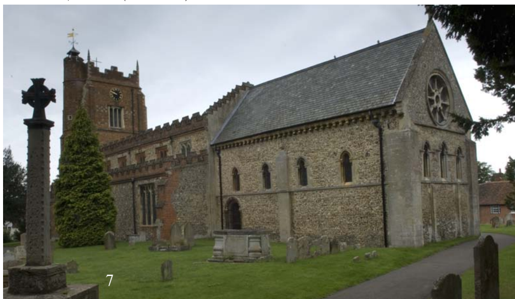
Below: Church of St. Nicholas (Grade I Listed)