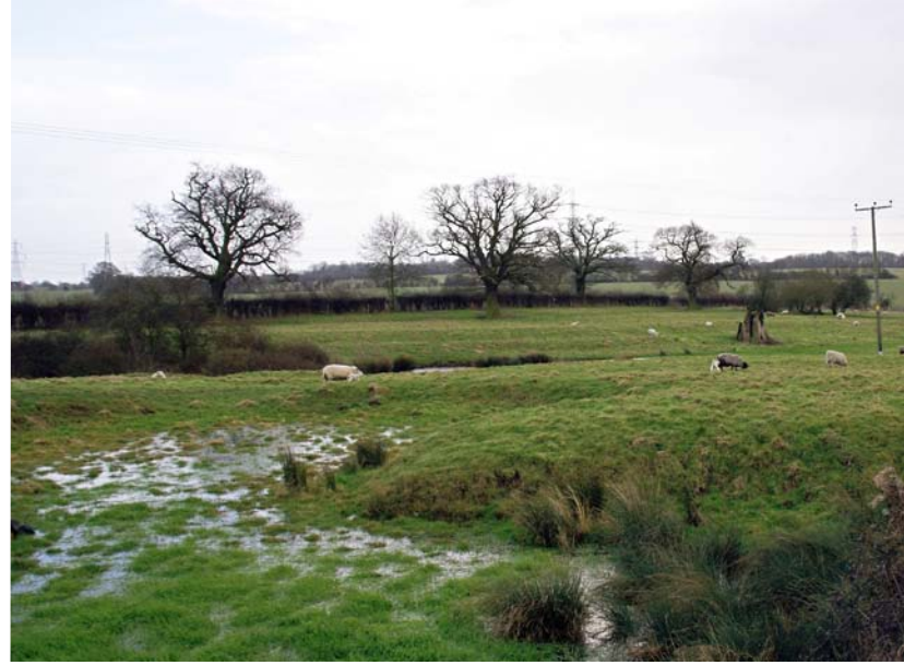
Ancient landscape, Kirby Hall Road.

The gardens constitute an integral and aesthetically pleasing part of the village landscape, which is at risk of being irrevocably spoiled and damaged by developments undertaken without due consideration for the environment.