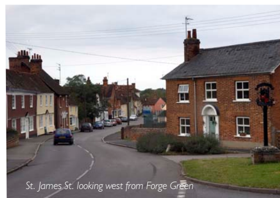
St. James St. looking west from Forge Green