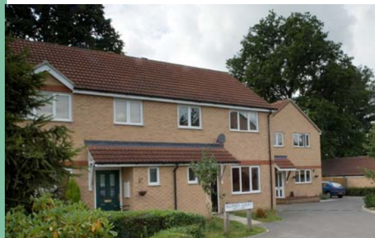
Above: New housing in New Park, Alfrey Court. Below: The 'tunnel of trees' at Sudbury Hill