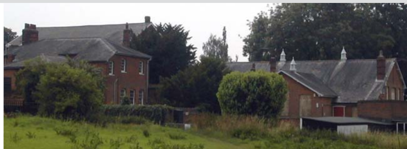
Old Police Station and British School face the challenge of modernisation