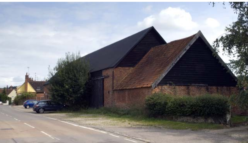
Above: Barns at the site of the old Nunnery Below: Hedingham House, the ancient Guildhall is incorporated