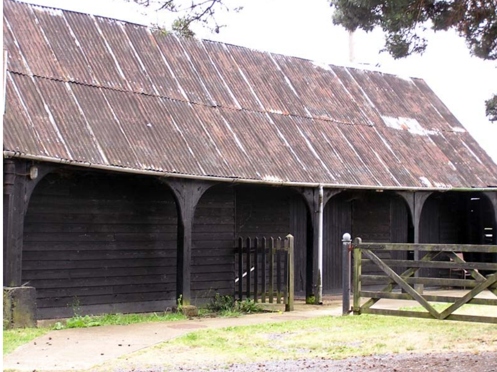
The Scout Hut