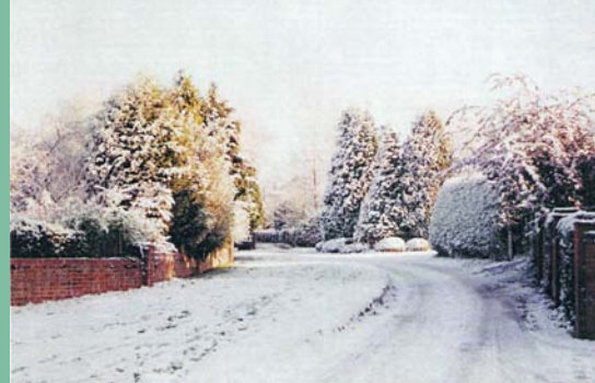
Above: Entrance to Pottery Lane, no houses in view