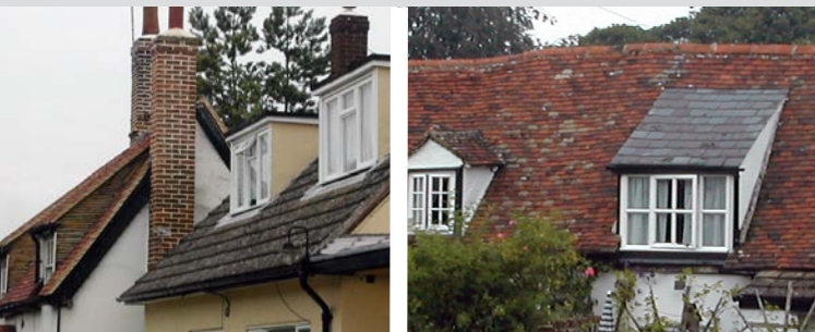
Various dormer styles in close proximity