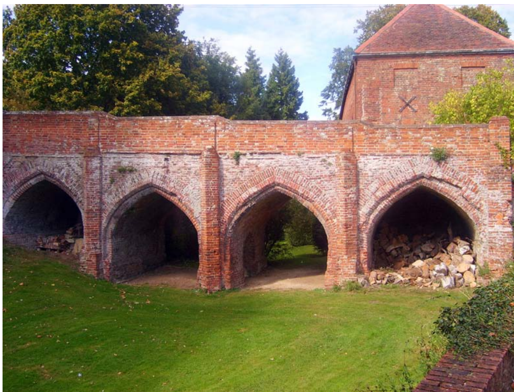
Above: The Tudor Bridge spans the moat at Hedingham Castle