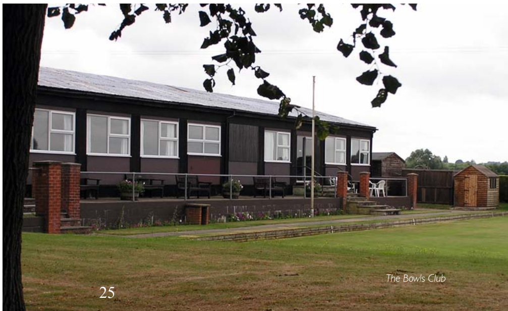
The Bowls Club