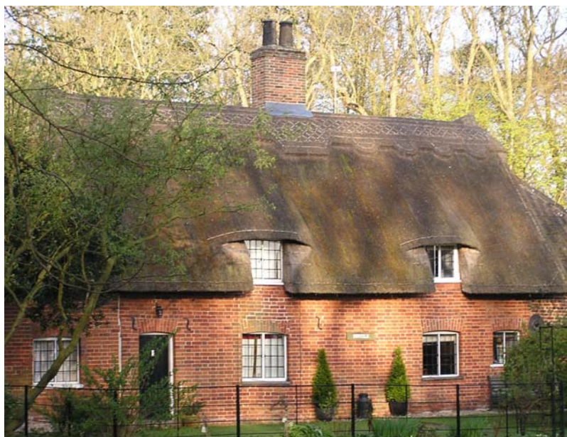
Above: Keepers Cottage, Rushley Green. Below Left: Forge Green. Below right: Pye Corner

Although Rushley Green is often regarded as a single Green it is in fact registered under three different owners, only one of which is the Parish Council.