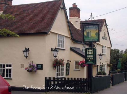
The Rising Sun Public House