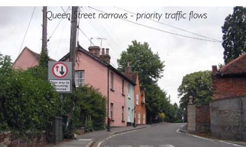
Queen Street narrows - priority traffic flows