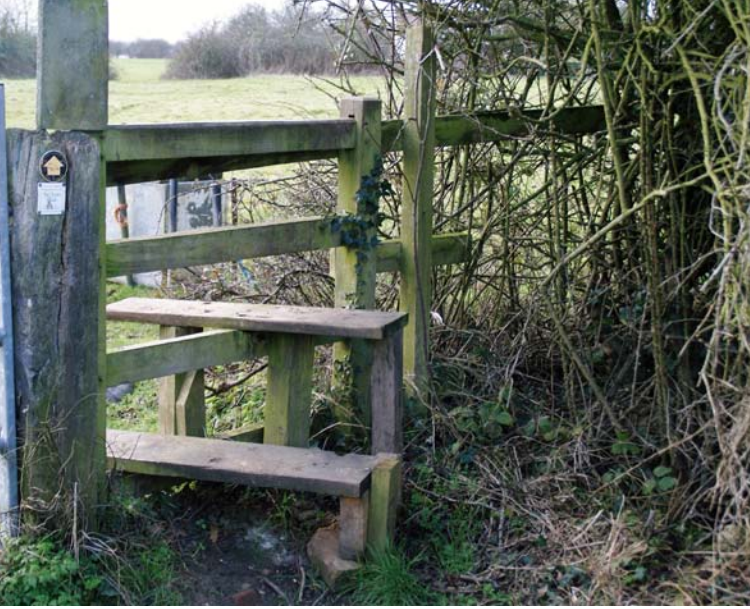
Stile at Scotch Pasture

The Parish contains a number of other notable landscape features. Eady's Lane has protected verges along its length in recognition of its significance as a wildflower habitat for both orchids and the rare Essex Sulphur Clover. Sympathetic management by the Heritage Society and Essex County Council is necessary to preserve these wildflowers. Footpath 30 follows a route through the ancient field workings surrounding Little Lodge Farm and on the top of Brick Hill, overlooking the village from the west, evidence of Roman settlement is commonly found in the field ploughing. Similarly, evidence of Roman habitation and metal smelting was found when the pumping station was built at Maiden Ley.