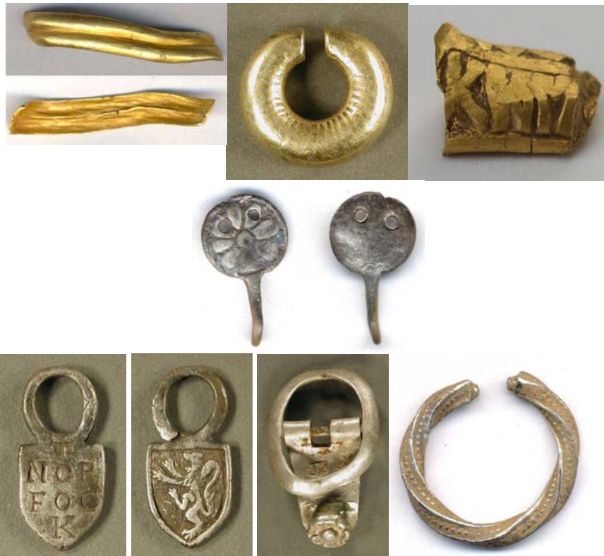
Bronze Age rings, Viking bullion and a Duke of Norfolk pendant New archaeological Treasure at Baintree District Museum