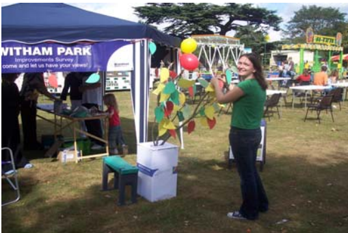
(A member of the public adding her comments to the 'tree' at the Children's World Fun Day 22 nd September)

Drawing on approximately six months of consultation with the community, a sketch design (available to view on BDC website) for improving Witham Public Park has been prepared. The design shows improvements to much loved existing features such as the fountain, seating and open grassed areas, as well as providing new facilities suggested by the community. These include toilets, new play equipment, a shaded outdoor classroom, picnic and garden areas and a fitness trail.