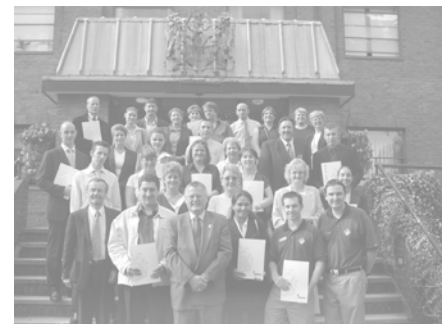
Food Hygiene Award Winners 2003

A copy of the qualifying criteria for the hygiene award can also be found on the council's web page at www.braintree.gov.uk/environment/food/default.htm