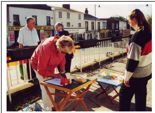
Forecourt of Halstead Post Office