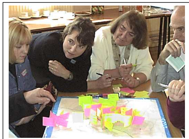
Initial workshop at Queens Hall