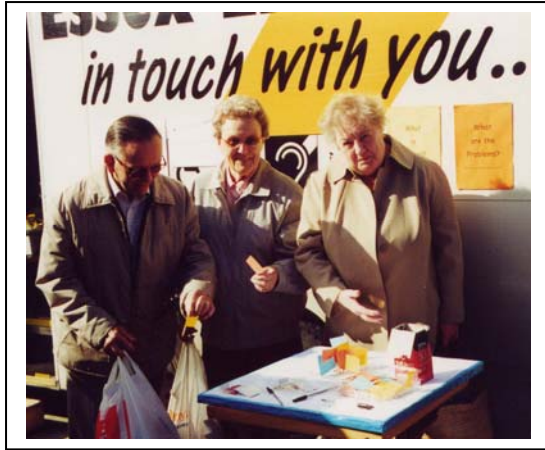
Mobile Library visiting sheltered accommodation