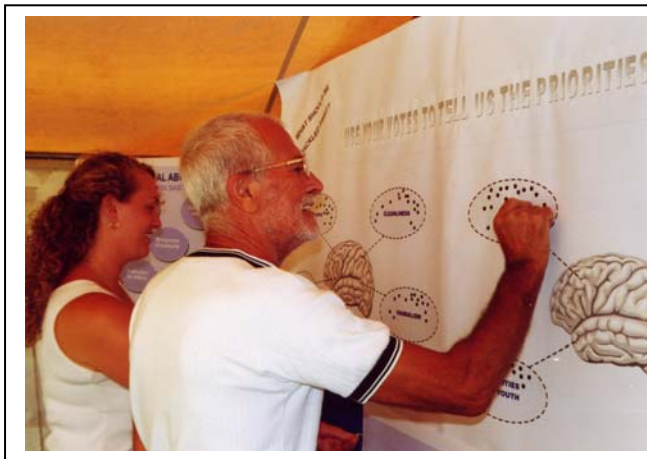
Prioritising at Halstead Hospital Fete 2001