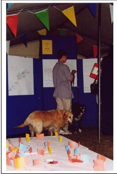
Gathering views at Halstead Hospital Fete 2000